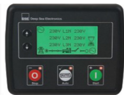
DSE4520 MKII AUTO START & AUTO MAINS FAILURE CONTROL