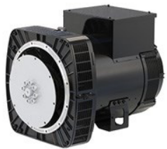
Leroy Somer TAL-044-D