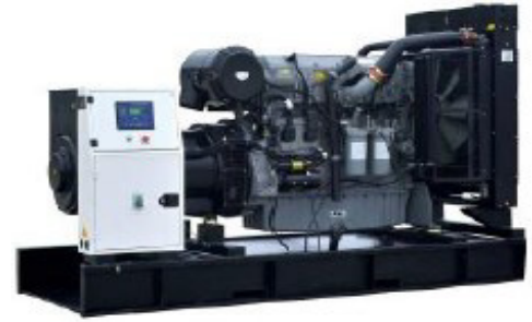
Open Type Image for illustration purposes only.