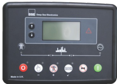
DSE6120 MKII AUTO START & AUTO MAINS FAILURE CONTROL