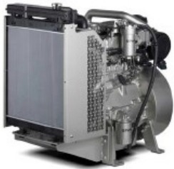
PERKINS Engine 1106A-70TAG3