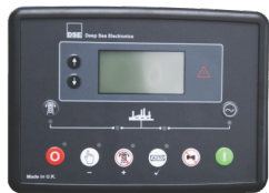
DSE6120 MKII AUTO START & AUTO MAINS FAILURE CONTROL