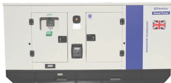
Silent / Closed Type Image for illustration purposes only.