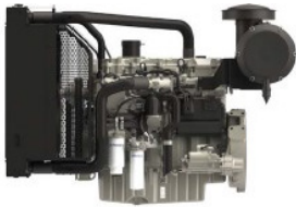
PERKINS Engine 1506A-E88TAG5