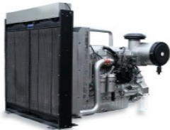
PERKINS Engine 2806A-E18TAG2